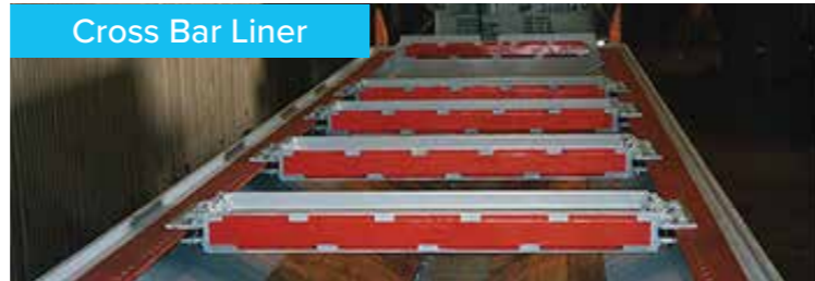
Cross Bar Liner