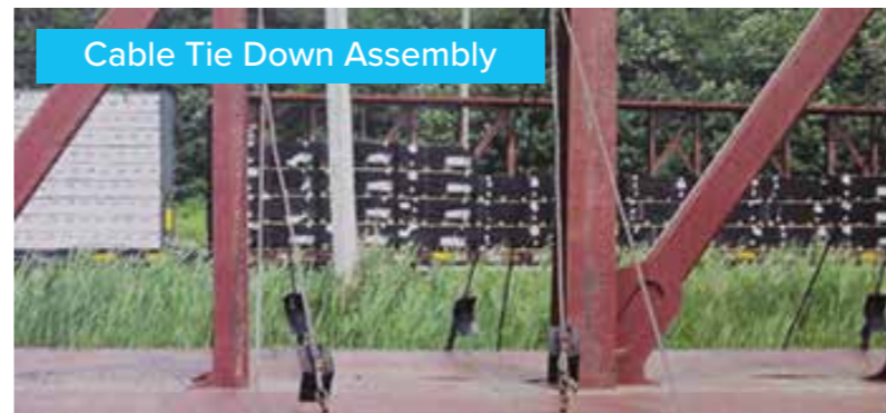
Cable Tie Down Assembly