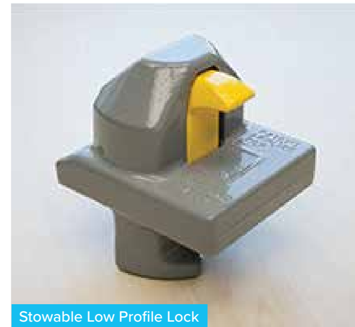
Stowable Low Profile Lock