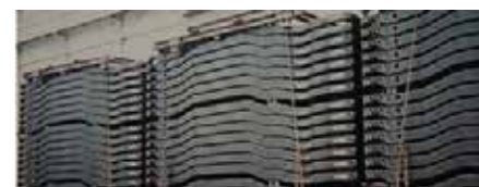
Frame Chain Tie Down System