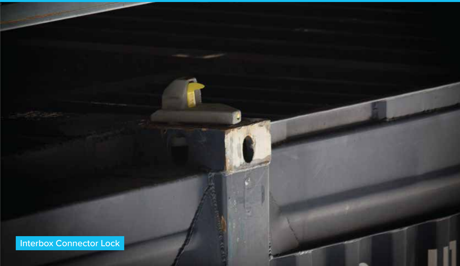
Interbox Connector Lock

Holland's container securement line offers a variety of locks for different container configurations. All of our locks are automatic to make loading and unloading freight containers more efficient and safer.