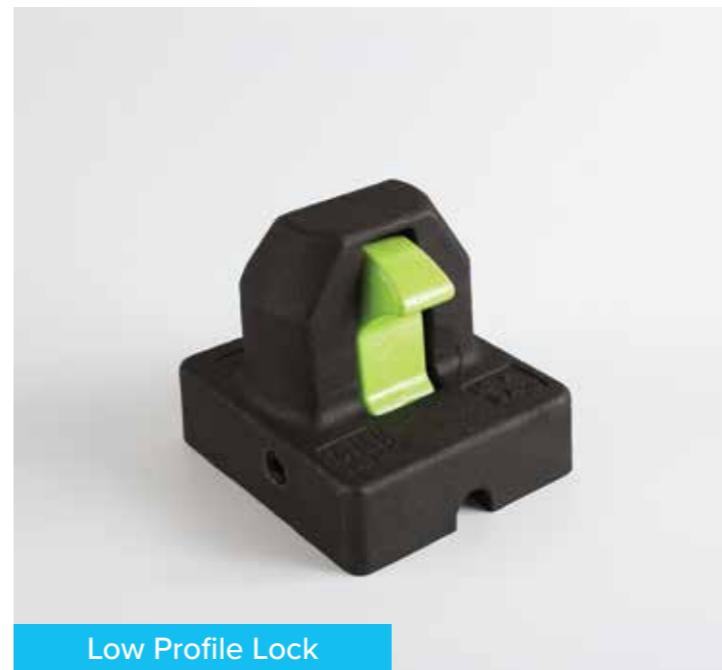
Low Profile Lock