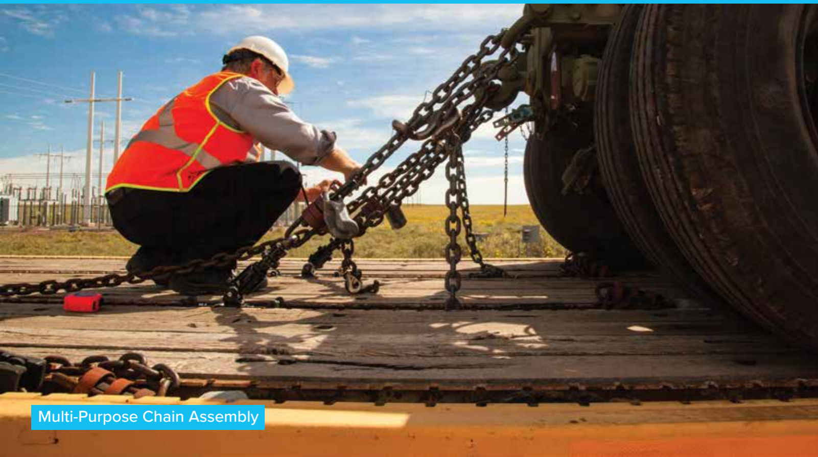
Multi-Purpose Chain Assembly

Our load securement chain and cable assembly systems make sure your cargo arrives at the destination safely. We have specially designed chains for specific applications and custom cable assemblies to secure many types of products.