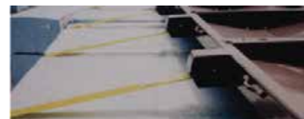
Webbing Strap Assembly